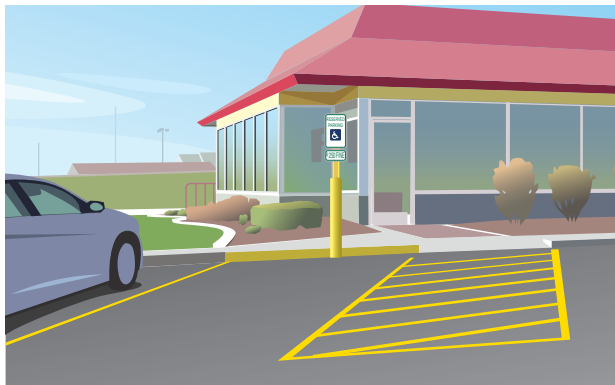
Illustration of a legal angled accessible parking space.

Any facility offering parking for employees or visitors must provide accessible parking for people with disabilities. An accessible parking space consists of a vehicle space and a diagonally striped access aisle. The entire space must be kept clear of obstructions—including ice, snow, shopping cart corrals, trash cans, seasonal garden displays and bicycle racks—at all times.