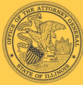
Kwame Raoul Illinois Attorney General

Remember: College is one of the biggest financial expenses of your life. When considering your options, make sure you get answers to the questions in this brochure to help you make an informed decision.